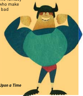
Twice Upon a Time

With George Lucas as Executive Producer, John Korty directed his most ambitious animated film, a comic fantasy about the creatures who make good dreams and bad dreams and a devious plot to remove the Magic Mainspring from the Cosmic Clock. Korty's "Lumage" process involved intricate collage of luminescent fabric (US 1983) 75 minutes plus discussion.